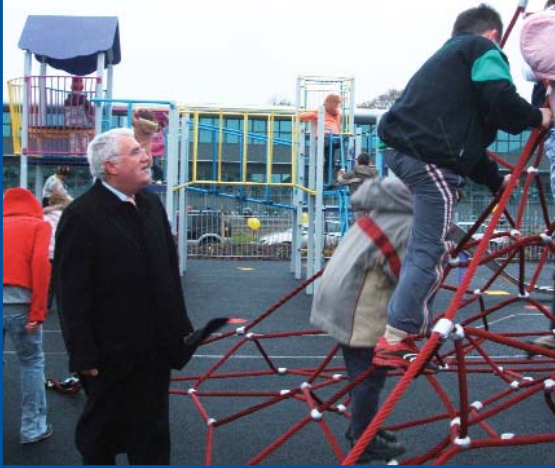
Minister Roche at the new playground in Blessington

Minsiter Roche has doubled the funding for the provision of playgrounds in County Wicklow to €120,000 for 2006. Nationally Dick has allocated record funding of over €4m for the provision of playground facilities in 2006. Each City and County Council will receive a 100% increase on the amount provided in 2005. Councils may use the funding to provide playgrounds at up to four locations.