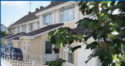
The recently completed James Everett Refurbishment Scheme at a cost of €1.7m

"I was very pleased to give approval to start construction works on this major regeneration scheme. I have already committed the necessary capital funding for the project. The regeneration of Fassaroe estate has been one of my highest priorities as Minister for the Environment, Heritage and Local Government and I am pleased that we are now getting regeneration activity on site at local level."