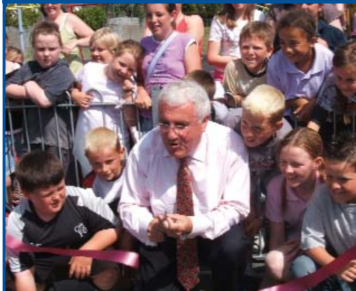
Dick performing the opening of the Newcastle Community Playground

Minister Roche has doubled the funding for the provision of playgrounds in County Wicklow to €120,000 for 2006. Nationally Dick has allocated record funding of over €4m for the provision of playground facilities in 2006. Each City and County Council will receive a 100% increase on the amount provided in 2005. Councils may use the funding to provide playgrounds at up to four locations.