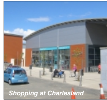
Shopping at Charlesland